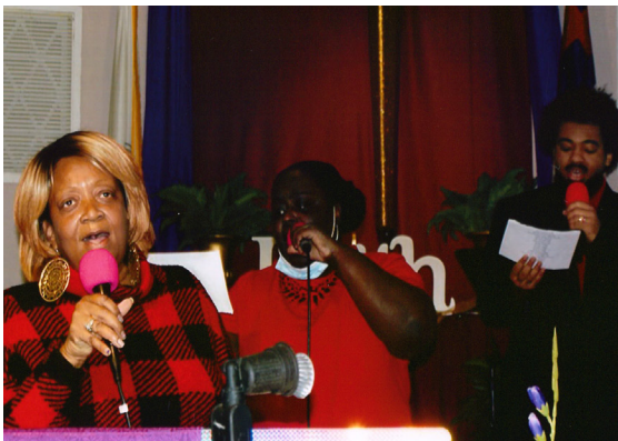
Adult Praise Team