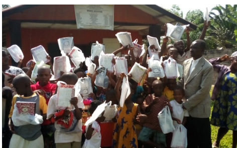
Christlove Liberia children with their Christmas gifts