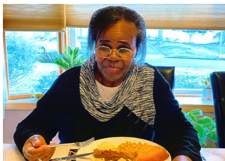
Thanksgiving dinner in our daughter's home in New York