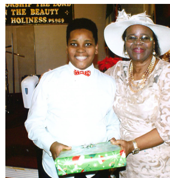
Christmas gift to a child