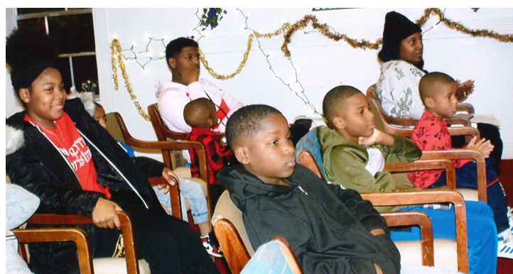
Children at the service