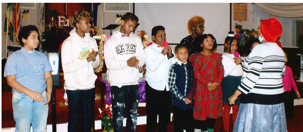
Praise Team from Spirit of Life Church